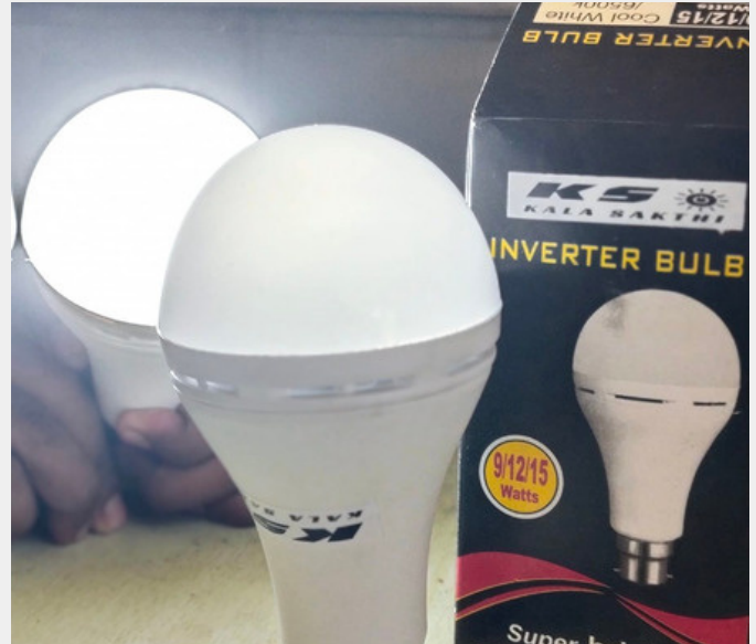
Self designed Inverter bulbs and Multipurpose Hall Amplifiers launched by Vishwakarma R & D Team