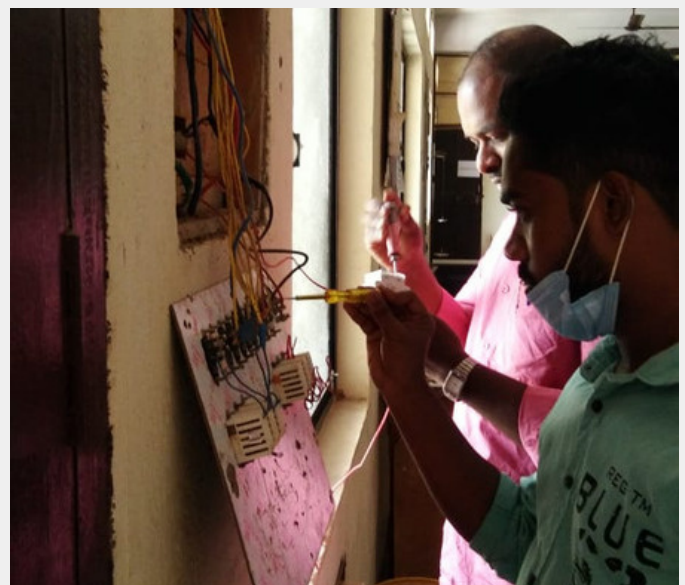
Automatic bell timer implemented in our college premises by Vishwakarma R & D Team