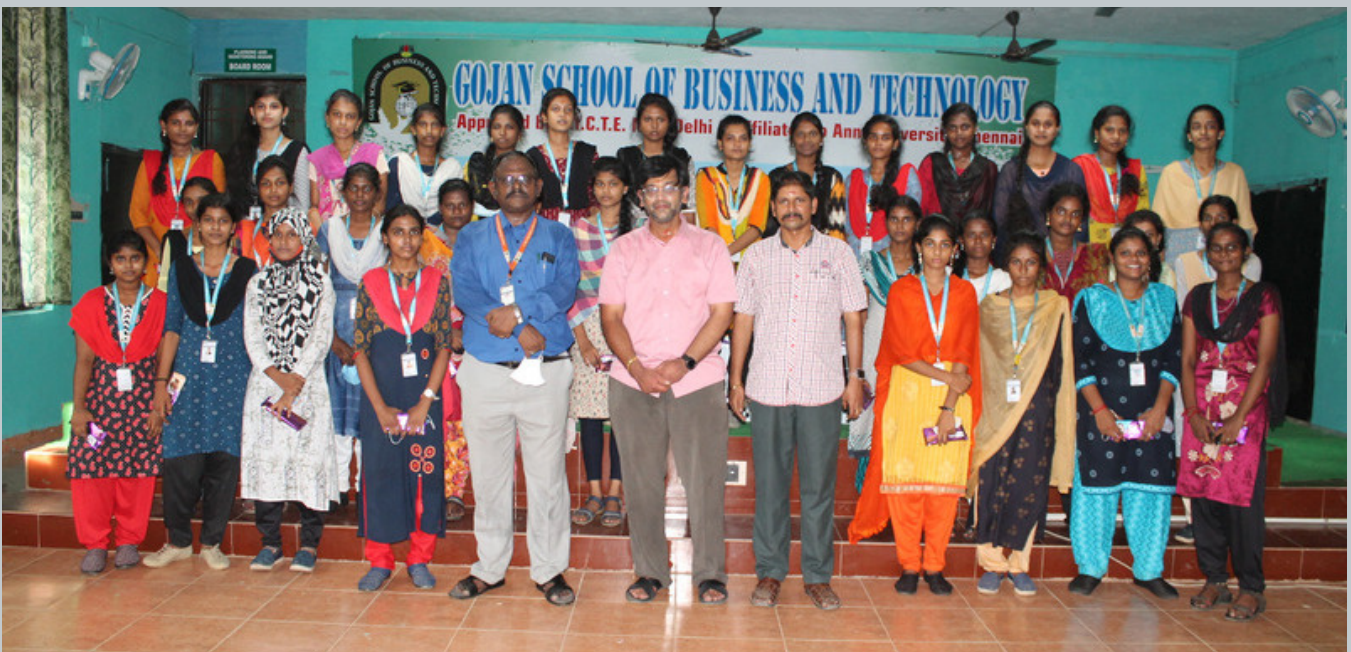
The first year student toppers of various departments were felicitated with endowment awards on 02.07.2022