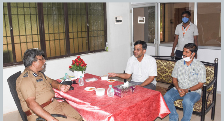
Director General of Police / Director of Tamil Nadu Fire and Rescue Services visited the campus on 28.07.2022