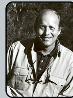
H. Jackson Brown Author of Life's Little Instruction Book

"The best preparation for tomorrow is doing your best today"