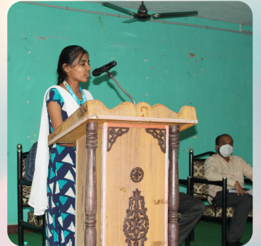
Gojan Science Club Organized Guest Lecture titled "SCIENCE & TECHNOLOGY DEVELOPMENT & ITS ISSUES" on Feb 28, 2022