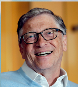
Bill Gates Co-Founder of Microsoft