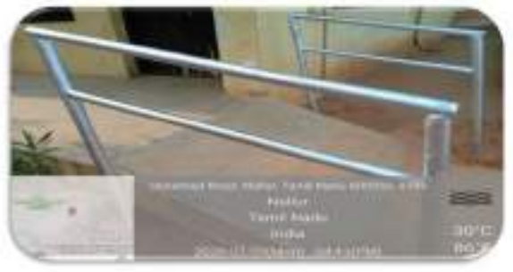
FACILITIES PROVIDED RAMP WITH HANDRAILS